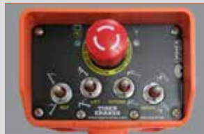
Optional Wireless Remote with Corded Tether adds work zone freedom to crane operation.