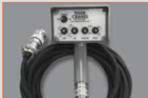
Standard Corded remote features a heavy duty aluminum housing and purpose built umbilical cord for maximum durability