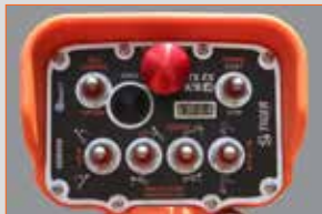
EP model adds wireless 3 function proportional control with digital load display, improving operational smoothness and load handling.