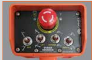
Optional Wireless Remote with Corded Tether adds work zone freedom to crane operation.

The 5031E and EP are the smallest models built with the hex boom design. Featuring 21 ft of full hydraulic reach with self-aligning hex booms, dual 12 V DC motors for increased duty cycle and Anti-Bounce Technology these electric cranes offer all the big crane features in a weight saving package.