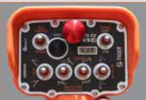
EP model adds wireless 3 function proportional control with digital load display, improving operational smoothness and load handling.