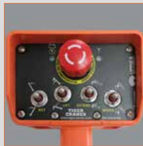
Optional Wireless Remote with Corded Tether adds work zone freedom to crane operation.