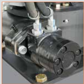
Double Reduction Full Power Rotation is very durable and trouble free.