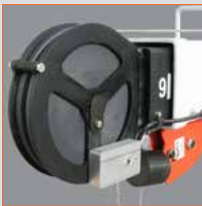
Full Hydraulic Extension and Nylatron Sheave provide quicker picks and less maintenance.