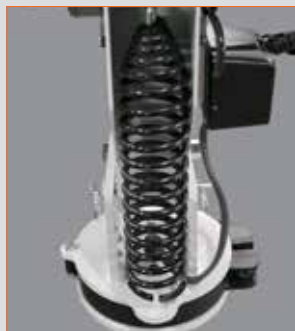
Spring assist for easy boom maneuvering