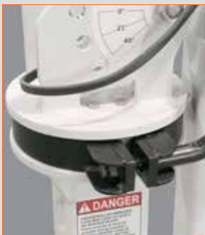
Slew bearing for easy rotation and manual band brake