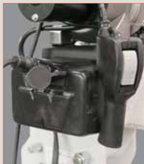
Detachable 12 ft Corded Remote